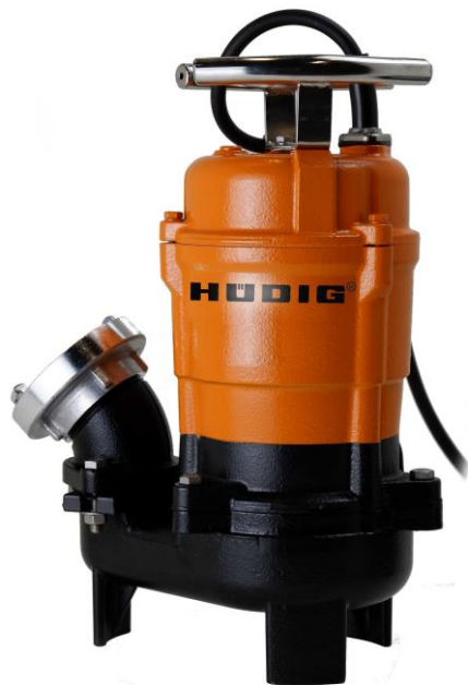
HC 37 SAV