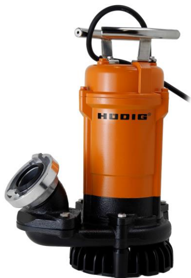
HC 40 SR