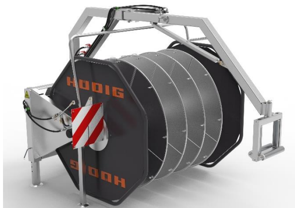
Hose Reel SH 1000 all Features

HÜDIG has set standards in the development of irrigation machines. For more than 100 years now, experience from agricultural irrigation has been utilised for the development and improvement of our products. The hose reel developed for irrigation applications simplifies the supply of water to the irrigation machine many times over compared to the laying of quick-coupling pipes. The hydraulically driven hose reel lays the hose in the desired position and picks it up again reliably once irrigation is complete. It can be mounted in the front and rear hydraulics as well as in the front loader with the aid of an adapter. Only a double-acting control valve is required for the drive. Various options round off the convenient supply line installation.