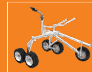
5-wheel sprinkler skid