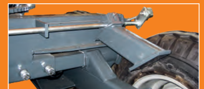
pendulum locking for tandem axle