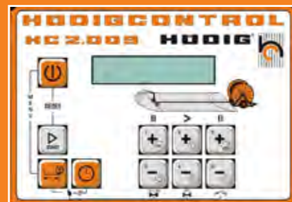
electronic feed-in control