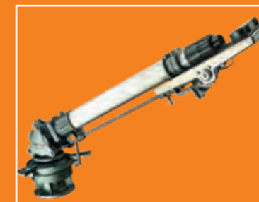
large-area sprinkler made by Komet