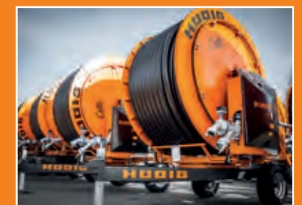
Irrigation machines in full size