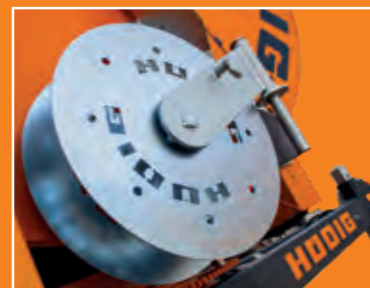
supply hose reel