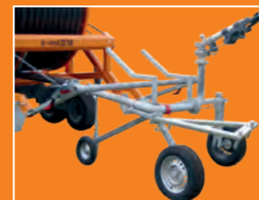
automatic sprinkler trolley take-up