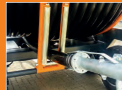
PE pipe guidance