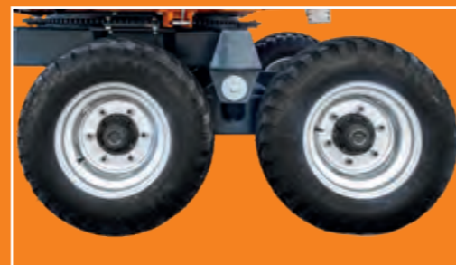
tandem axle IROMAT II