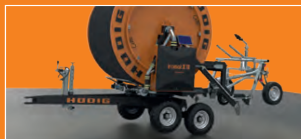
active pendulum locking