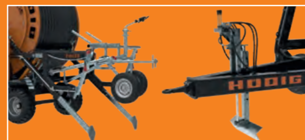
hydraulic support legs at rear side (standard)