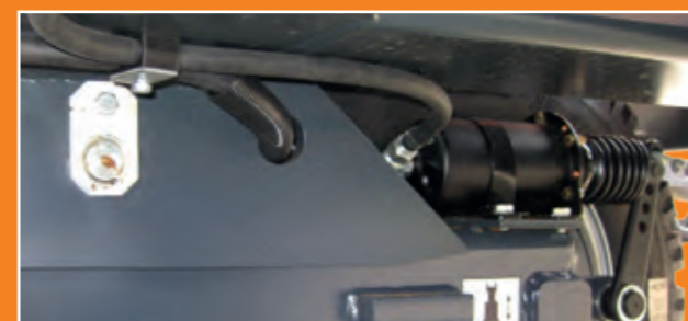
chassis IROMAT V with applied brake