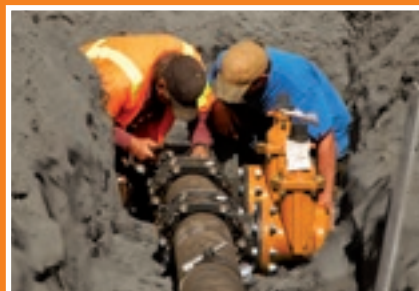
Water supply to construction sites