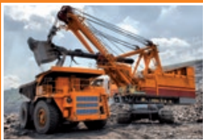
Cleaning construction vehicles